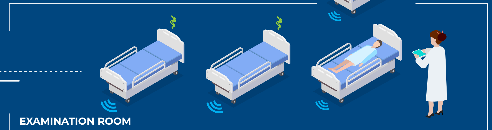
Beds are used in the right manner, thereby improving the quality and safety of healthcare delivery.