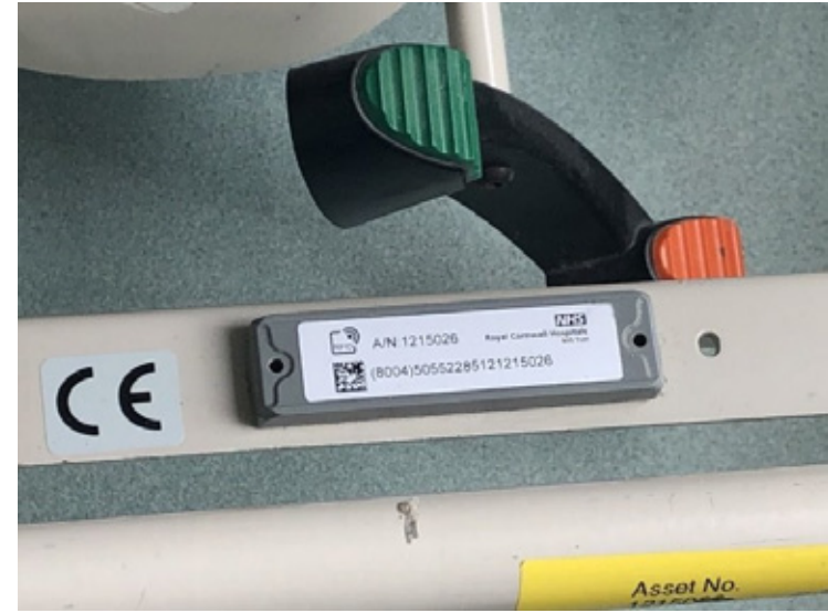
Each hospital bed has a unique RAIN RFID tag, so that staff can monitor the location and status of each bed.