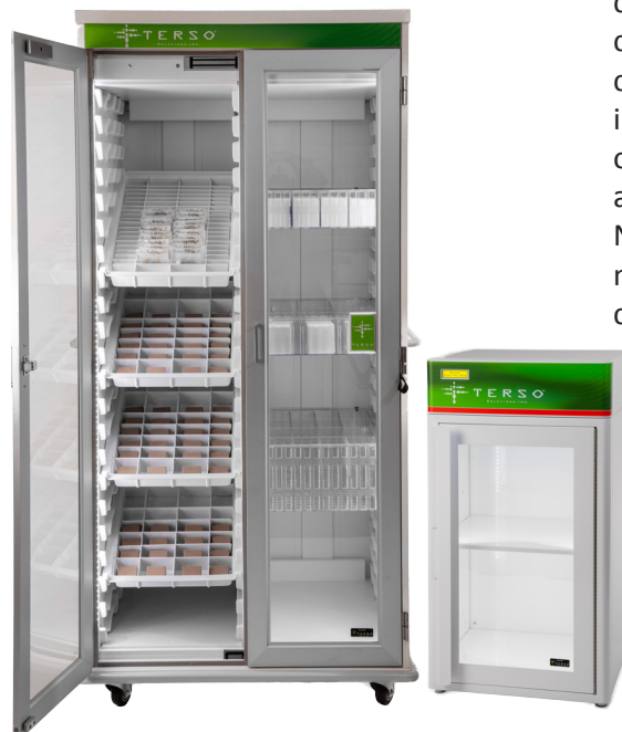
RFID-enabled ambient cabinets, powered by Terso Solutions, Inc.

North Kansas City Hospital plans to grow their automated inventory management system in the coming years by adding RFID-enabled refrigerators and freezers.