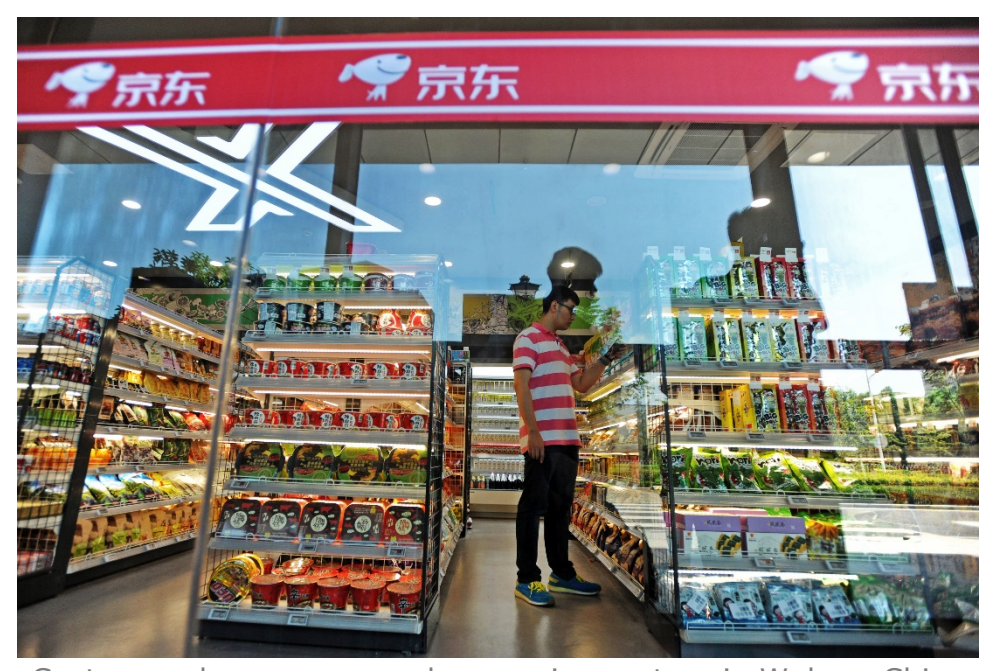
Customer shops unmanned convenience store in Wuhan, China

dramatic increase in availability can increase both revenue and margin. Besides unmanned retail, RAIN RFID use-cases related to perishable food are expected to increase dramatically in the future. RAIN RFID provides unbeatable features for this end-use area, as it gives unique identity for each item and automates reading events. When combined, these features facilitate effective management and control of expiry dates. Possibilities for reducing food waste are enormous. Currently RAIN RFID is mainly used to give each object an individual identity and to communicate it wirelessly to a central database. In the future, various sensor technologies can be added to the same system via RFID sensor tags. There is already an existing customer need for recording sensored product data, via sensor tags attached to packaging. However, until now the cost level of tags capable of data logging has been preventing wide-scale use. As this obstacle is being removed, this application area will see significant growth assuming the sensor tag disposal/reuse after use will be sustainably arranged.